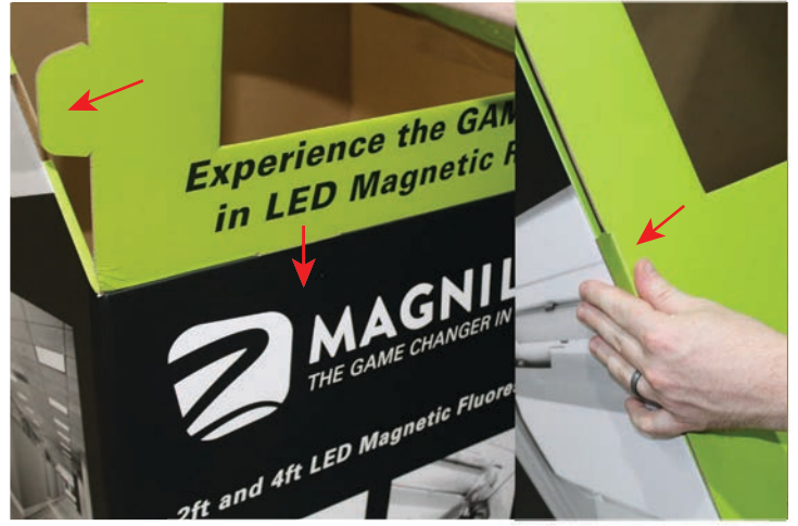
Step 8: Take outer green support and start inserting tabs at the bottom into pre-cut slots and continue to work up the unit, securing all the tabs until you feel them lock.