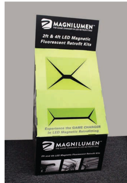
POP Display is finished!