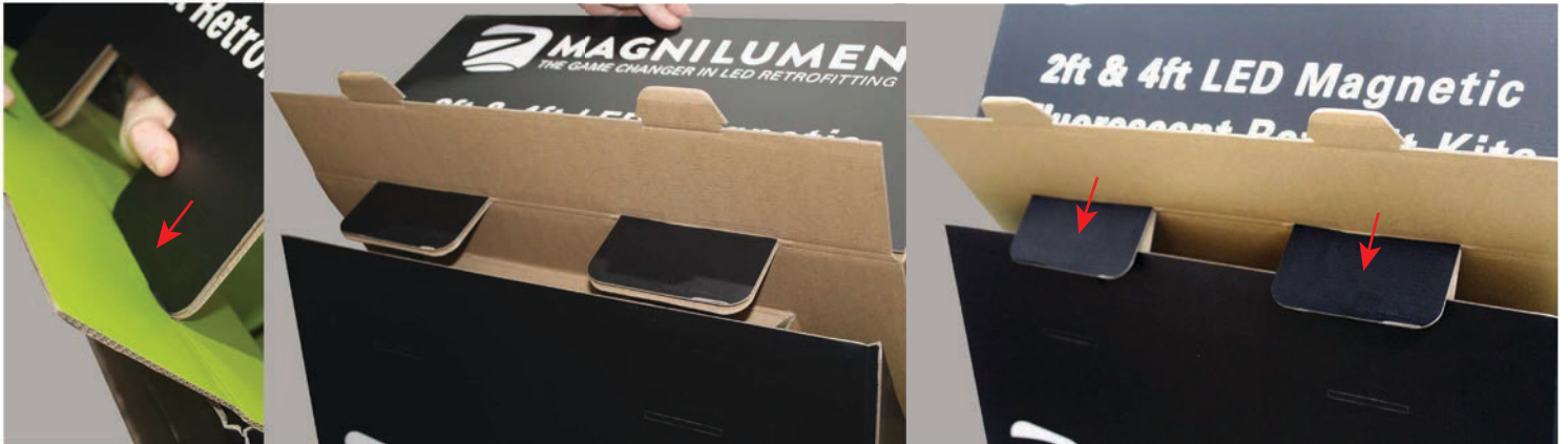
Step 9: Pull out the top of the outer green display slightly to insert header into two slots. Insert, then split tabs over the back of the display.