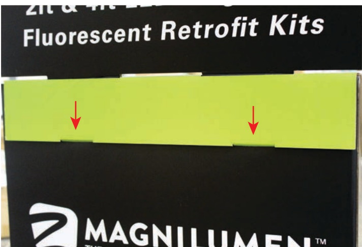
Step 10: Re-secure all green tabs onto the main display on the sides. Secure the final two green tabs on the back of main unit into the slots at the top of the unit.